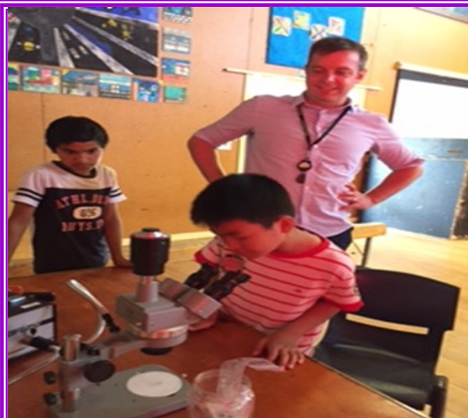
Tawa Class with EWBZN

Please check your child's hair as NITS are on the move. Call to the office if you need a NIT Pack & Comb we have a few left.