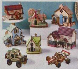
3D architectural creating