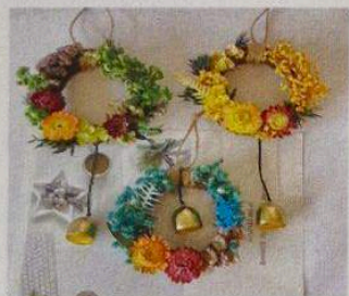
Dried flower craft