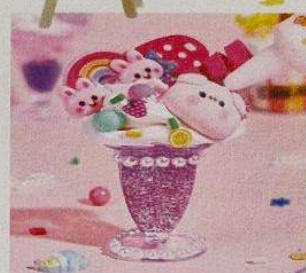
DIY clay making