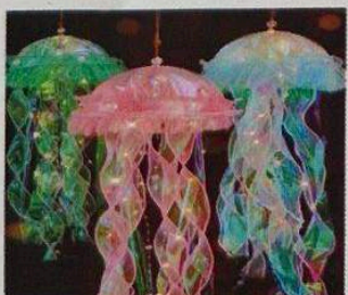
Jellyfish lamp making