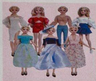
Doll clothes making