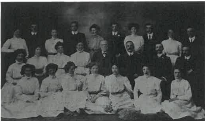
Teaching staff 1909