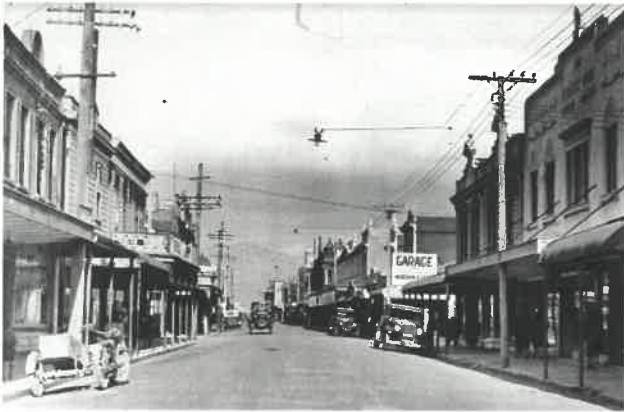
Jackson Street - Early 1900's

Petone Central School has been a local school since 1882, our school roll being supported hugely by local industry. For many years, workers and their families called Petone home, living in a thriving community. Petone was a working class town with large industrial businesses, including several car assembly plants, a meat processing plant, a wool processing plant, a tobacco factory, Palmolive and Unilever factories, and a railways yard. The majority of these businesses were started very early in Petone history and many continued until the 1970's/1980's. One remnant of this industrial history is Petone wharf, which was originally built to quickly transport meat from Gear Meat Works to Wellington ready for export.