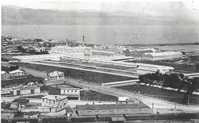
Gear Meat Works